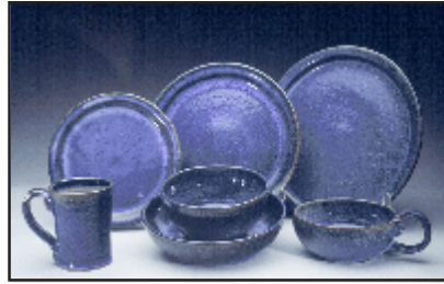
blue dinnerware place setting: 8" luncheon plate, 10.5" dinner plate, 12" dinner plate, 6" chowder bowl with handle, 6" soup/salad, inside 8.5" pasta bowl, and mug.